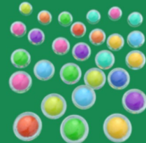
SINGULAR AMINO ACIDS